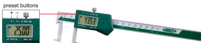
1121-150A type A