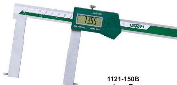
1121-150B type B