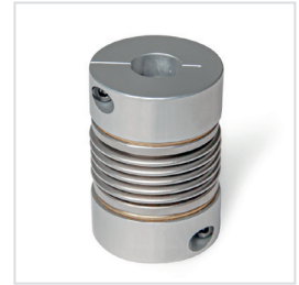
2 Bore code B without keyway