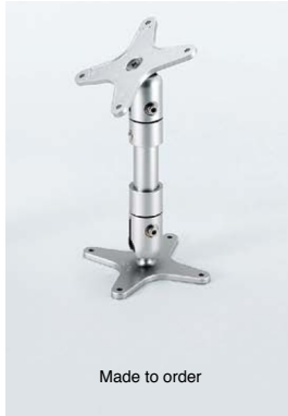
Made to order