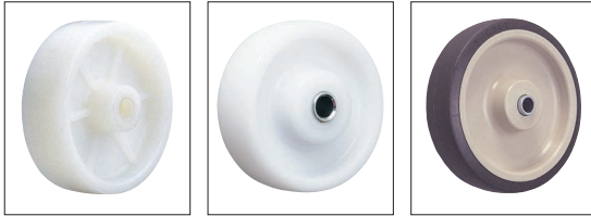
N: Polyamide wheel NWB: Polyamide wheel (w/ Bearing) UWB: Polyurethane wheel (w/ Bearing)